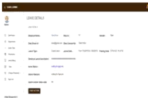
Fig 3: Leave Details