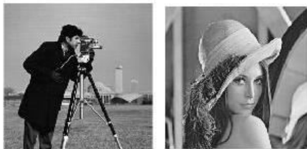
Fig -3: Result