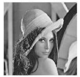
Fig -3: Result