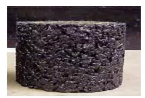
Fig 3. Sample Specimen used in present study

The optimum bitumen content (OBC) for the SMA mixture is determined and is found to be 6.42 % (by wt. of total mix). This SMA mixture without additives is considered as the control mixture for the subsequent studies.