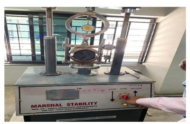
Fig 2 Setup of Specimen used in present study

The heights of the samples are measured and specimens are immersed in a water bath at 60^{\circ} C for 35\pm5 minutes. Samples are removed from the water bath and placed immediately in the Marshall loading head . The load is applied to the specimen at a deformation rate of 50.8 mm/minute. Stability is measured as the maximum load sustained by the sample before failure. Flow is the deformation at the maximum load. The stability values are then adjusted with respect to the sample height (stability corrections). For the proposed design mix gradation, specimens is prepared for each bitumen content within the range of 5-7 at increments of 1 percent, in accordance with [9] using 50 blows/face compaction standards.