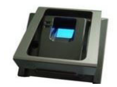
Optical reflexive fingerprint scanner

Volume: 04 Issue: 04 | April -2020 ISSN: 2582-3930