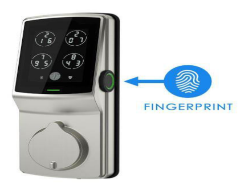
Mechanical fingerprint scanner

1.3. Mechanical: The surface contains thousands of pressure transducers. The finger ridge puts more pressure on pressure transducers that forms unique pattern.