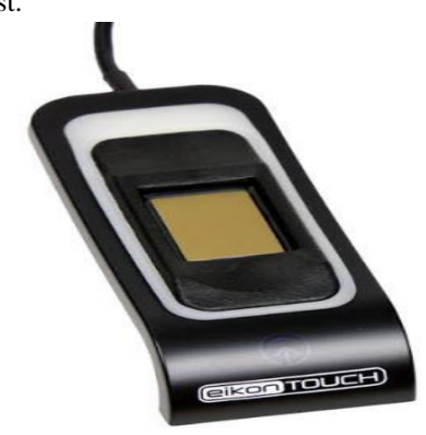
Crossmatch EikonTouch 710 Capacitive fingerprint scanner

1.2. Capacitive: The sensor panel contains multiple transducer elements (pixels). These elements contain two adjacent electrodes. Capacitance around electrodes is decreased when finger is touched on panel. It is reduced more at raised portions and reduced less on spaces between them. This is not operative with skin with scars, moisture or dust.