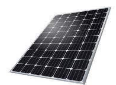
Fig 2.5 Solar panelFig 2.5 Solar panel Fig 2.1 Solar panel

2.2.1 Solar panel : A photovoltaic panel is a packaged interconnected assembly of solar cells, also known as photovoltaic cells. The functionality of this solar panel is to provide electric energy to start the mower which was stored via sunlight