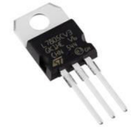
Fig. 2.8 regulator IC 7805

The regulator IC 7805 is signed for the intent of the conversion of the voltage to 5volt. We have some devices that work on the 5volt power supply. This transmogrify is done with the help of the 78xx series IC called 7805