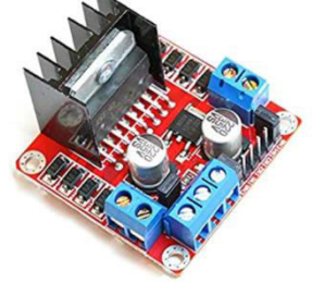
Fig 2.4 Motor driver module (L298N)

The figure shows the actual motor driver module for the gear motor. This motor driver module is useful to help the Arduino nano to control the direction of the motor and the motor works on the 12volt dc and the voltage is counted by this motor driver module. In this module, L298N IC is connected which can control the motors. The Arduino nano gives the PWM signal to the driver module and according to those signal the motors start working