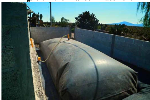
Fig.1.2: LDPE Balloon after Biogas Generation