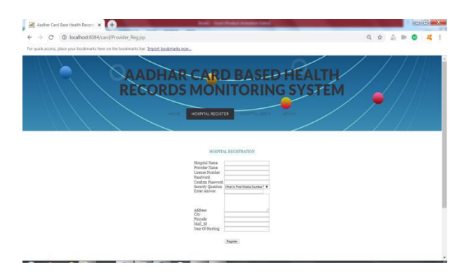
Fig.2 Hospital Registration