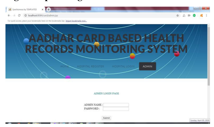
Fig.4 Admin Login