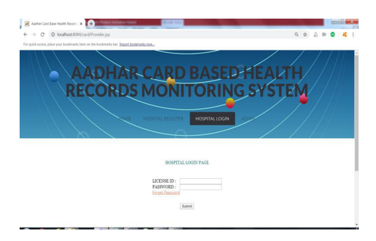
Fig.3 Hospital Login