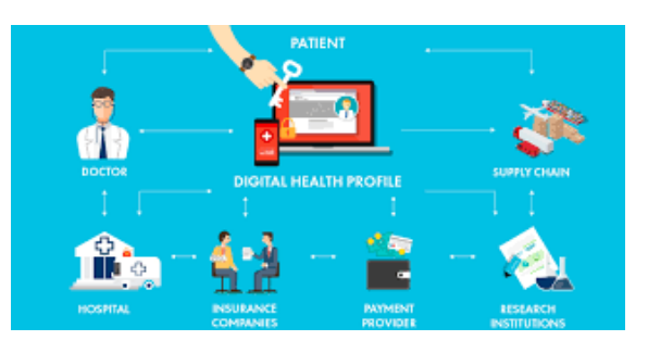
Fig 2: Health Care in Blockchain

At some point of those instances, generation has advanced to the next degree. Most of the sector has migrated to the net international. But, due to this latest migration, safety vulnerabilities and privateness problems have multiplied loads as nicely. To triumph over this, the usage of diverse safety technology has elevated as properly. Blockchain generation is one such technology that provides protection and privateness to the users [3]. Blockchain is a composition that stores blocks together in more than one database, in a community through p2p network.