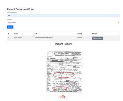
Fig 6: Patient Documents visible to doctors