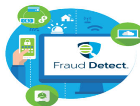
Fig1: Fraud detection for health care

In the US and other countries they have the National Health Care Anti-fraud association according to this health care fraud is an intentional deception or misrepresentation that could result in unauthorized benefit.