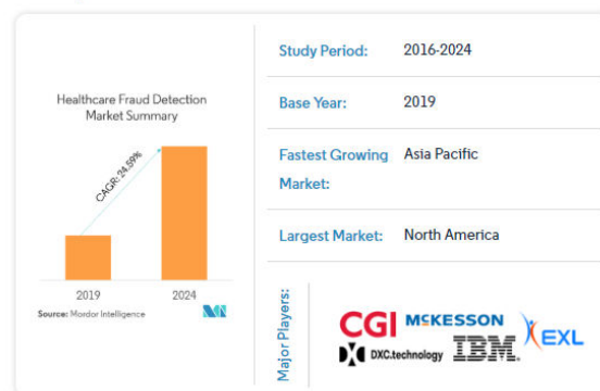
Fig2: healthcare fraud detection market - growth, trends, and forecast