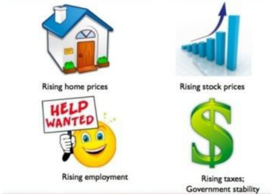
Fig 5: Growth benefits of advantages of fraud detection: