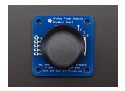
Fig -3: Joystick Module

associate degree a log values and send it to an ADC(Analog to digital converter). The ADC convert the analog price to digital signal .The digital signal is shipped to the motor driving IC(L293D) via digital knowledge output pin. L293D contains 2 y H-bridge driver circuits. In its common mode of operation, 2 DC motors area unit typically driven at the same time, each in forward or reverse and right or left direction. The motor operations of 2 motors area unit typically controlled by input logic at pins a pair of & seven and ten & fifteen. As joystick is slightly turned forward the voltage input at ADC will increase and therefore the motor starts rotating in forward direction. once the pot is turned back to middle position, the motor can stop. currently as a result of the pot is turned slightly reverse, the motor starts rotating in reverse direction, to prevent motor once more, the pot is turned back to middle position. Thus, the motors move forward or reverse and right and left as a result of the pot is turned forward or reverse and right or left. To implement these functionalities a software system program is embedded into internal FLASH of ATMega328P small controller. the 2 DC motors area unit controlled by L293D IC and Arduino ATMega328P consistent with the instruction of the Joystick.