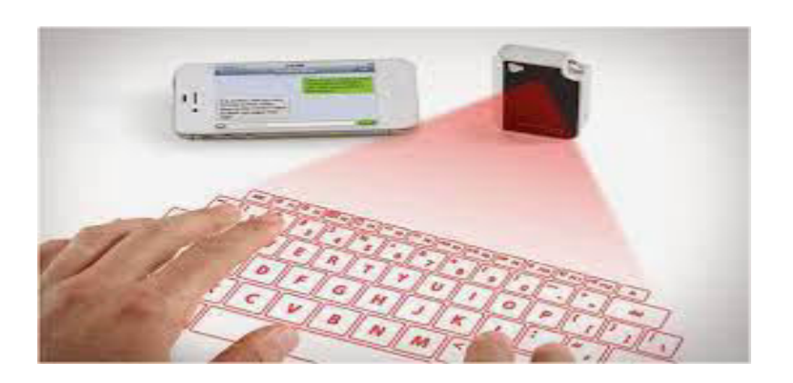
Figure 1: Canesta virtual keyboard

Objective - The expectation of this subject is to become familiar with the methods of planning easy to use interfaces or connections. Taking into account which, we will gain proficiency with the accompanying –