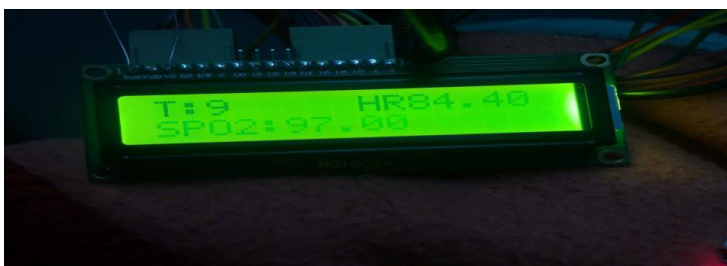
Picture1.DISPLAY OF DATA

The final result of the system is we get a person's heart rate, body temperature and oxygen level on the display. A sixteen by two display is used to show the data, on that digital reading are displayed so anyone can easily detect and read the parameters. By checking the readings of parameters one can detect patient's health But, if the readings are not in normal range then a person can immediately visit to the doctor. As shown in picture 1 three parameters are displayed where T is temperature, HR is heart rate and SPO2 is the oxygen level.