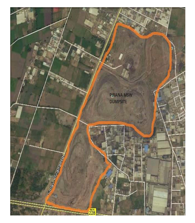
Figure 1 Study area: Pirana landfill site