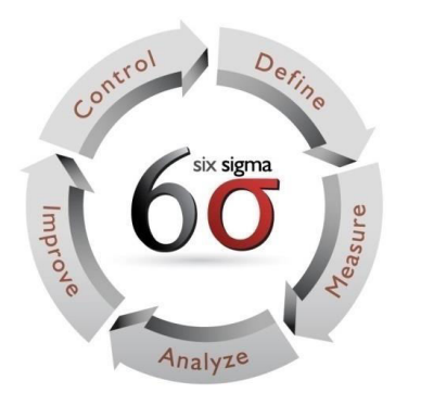
Fig. 1. Six Sigma Process

As indicated in the above figure the six sigma process basically involves the Define, Measure, Analyse, Improve and Control phases