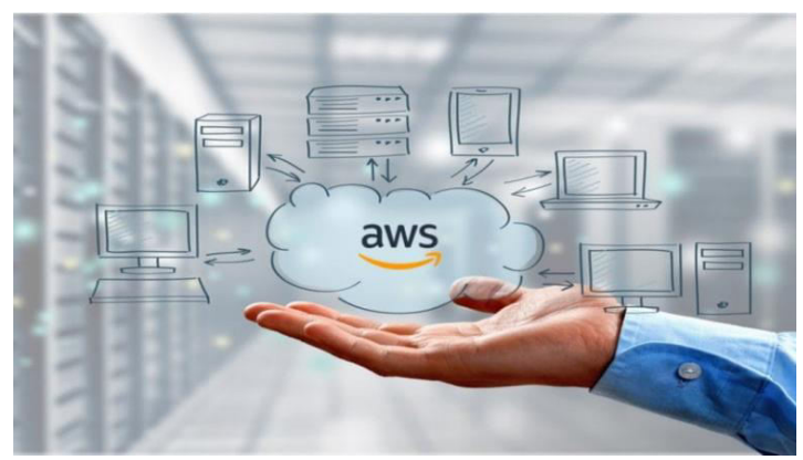
Fig-1: Benefits of AWS Cloud Technology

Cloud computing, in which computing resources are made available to users on demand as needed, is becoming a more popular business model. Cloud computing's distinct value proposition opens up new possibilities for aligning IT and business objectives. Cloud computing makes use of internet technologies to deliver IT-enabled capabilities 'as a service' to any required users, i.e., we can access anything we want from anywhere to any computer without having to worry about storage, cost, management, and so on. We'll look at 'Amazon Web Services (AWS),' which is one of the largest cloud service providers on the planet. AWS is the most trusted cloud computing provider, offering not only excellent cloud security but also excellent cloud services. AWS is a low-cost, pay-per-use cloud service that is also highly secure and easy to use. Review the various AWS cloud deployment and service models in Introduction to the Importance of Cloud Computing in AWS. It also looks at some of the advantages of cloud computing with AWS over conventional IT service environments, such as scalability, flexibility, lower capital costs, and better resource utilization, which are all considered adoption reasons for cloud computing with AWS.