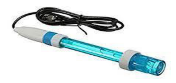
Fig: pH sensor

The pH of a solution is the quantity of the acidity or alkalinity of that solution. The pH may be a scale whose range is from 0-14 with a neutral point being 7. Values that are above 7 indicate a basic or alkaline solution and values below 7 indicates an acidic solution. It operates on 5V power supply and it's easy to interface with Arduino.6 to 8.5 is normal range of pH of water.