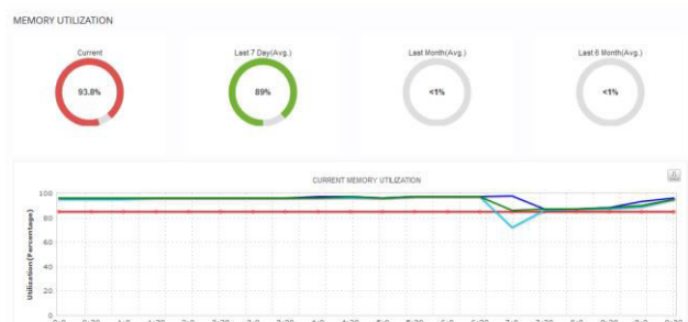
Figure 3. memory utilization test figure

of the Memory utilization at every acquiring moment and its changing rate.