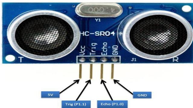
Fig 1.2 Ultrasonic sensor