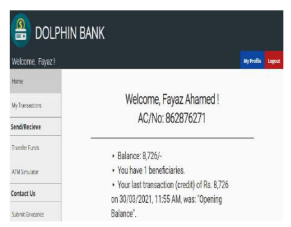
Fig.A.3. Customer Section

includes the investigation and possible changes to the existing system. Analysis is used to gain an understanding of the existing system description and set of requirements for a new system. If there is no existing system, then analysis only defines the requirements. Development begins by defining a model of the new system and continues this model to a working system. The module of the system shows what the system must do to satisfy these' requirements. Finally, the data models are to a database and processed to user procedures and computer programs. These are depicted under Fig.A.3 as customer section as follows,