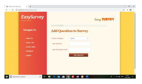
Fig 2 : Add Questions

Develop a method for accessing questionnaire data from the web server in a format that can be used in dynamic format.