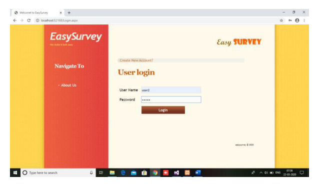
Fig 3: User Login

Send notification/thank you note to the users for participating the survey.