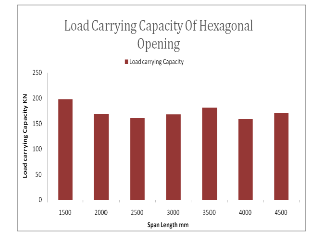
Fig. 1.1: Load Carrying Capacity of Tapered Shape and Hexagonal Opening