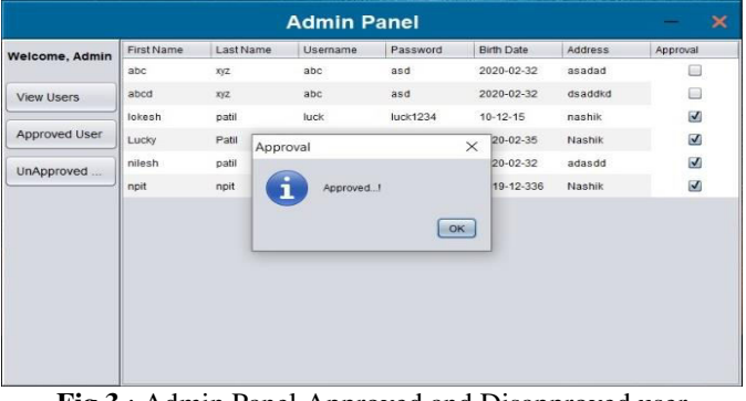
Fig 3 : Admin Panel Approved and Disapproved user

To check the output of the system I have implemented the expelled watermarking to assault profound neural networking.To apply watermark on image.