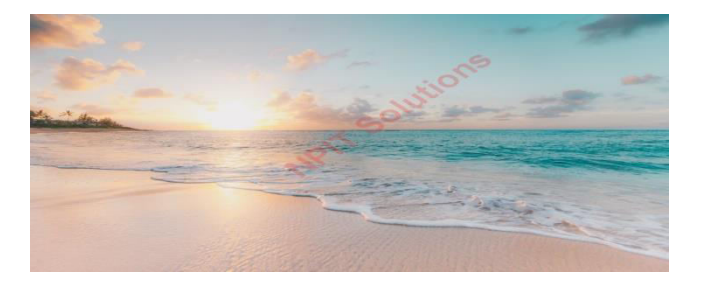
Fig 5 :Watermark applied on image