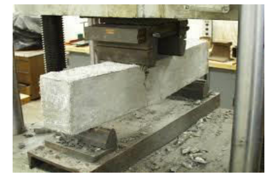
Fig-4: Testing of concrete beams