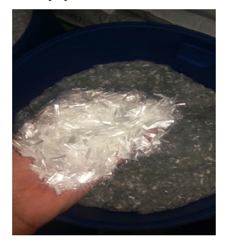
Fig. - 2: Polyester Fibre

Polyester is very important manmade fiber. Polyester is produced with a long chain synthetic polymer with ester. Polyester is produced by melt spinning process. Polyester fibers are alkali resistant. Polyester Fiber is used to improve the tensile and flexural strength, ductility, toughness and to arrest the crack of the concrete. Fig -2 shows the Polyester fibres used for out project work.