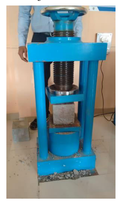
Fig-3: Testing of concrete cubes

To get the compressive strength the concrete cubes are tested on compression testing machine and for flexural strength the concrete beams are tested on Universal Testing Machine under two point load. Fig -3 shows the cube testing and Fig -4 shows the beam testing.