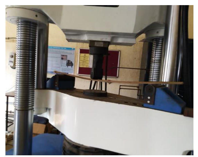
Fig -3: Bamboo Strip Bending Test

A beam of suitable length to support the test specimen was kept at right angle to the platform of the Universal testing machine. The test specimen was placed on supports with saddles and a wooden beam was placed over the specimen using saddles in such a way that load is applied through the loading head of the testing machine. The test specimen was then allowed to find its own position; the specimen, saddles, load and supports was aligned visually in one vertical plane. The loading of the test specimen was carried out uniformly at constant speed. The loading head of testing machine was moved at the rate of 0.5 mm/s. Deflection at the middle of the span was recorded at the points of sudden changes in deflection, at the time of failure and at maximum level. Crack development and the form of failure were noted.