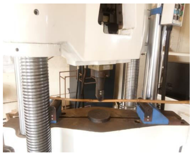
Fig -4: Hollow Cylindrical Bending Test