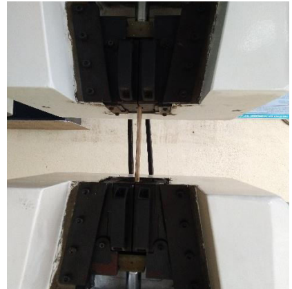
Fig -5: Bamboo Strip Tensile Test

This test was conducted on UTM. The grips were pressing the test specimen perpendicular to the fibers and in radial direction. The load was applied continuously and the movable head of the testing machine shall travel at a constant rate of 0.01 mm/s. The maximum load was recorded.