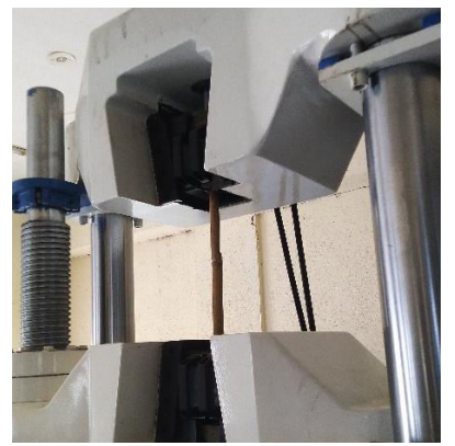
Fig -6: Bamboo Cylindrical Strip Tensile Test