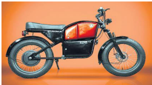
Fig.5 Electrical bike without engine mounting