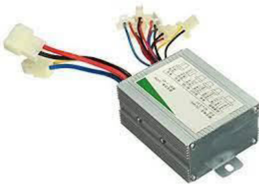
Fig.3 Motor Controller

The controller lets you operate the electric assistance on your electric bike and is an important part in how electric bikes work. The controller can be located on the dash board for ease of use. There are two main styles of controllers – pedal-activated and throttle-based controllers.