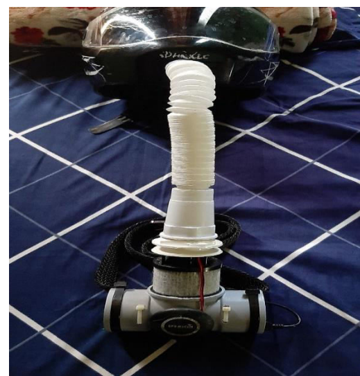
Fig-6: Actual project image

This implementation of the proposed system using NodeMCU, interfacing with GPS module can able to track the live location of the user, with the use of Blynk software. Also, this proposed system can filter air through a HEPA filter. This is quite a significant project for its originality and concept. We are using the Internet of Things theory which gives this project its uniqueness about the concept of the filtration system. The project aim to filtration of the air in the surrounding. Another very important aspect of our project is the Mobile Application portal that is designed in such a way that operators and citizens both will find it easy to use. This monitoring device can deliver the real-time location of the user with the help of Blynk application.