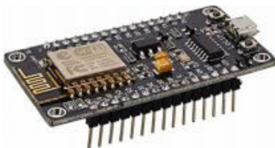
Fig -1: NodeMCU

NodeMCU is a generic WiFi-BLE MCU module and it has a high capacity to targets a wide variety of applications ranging from low-power sensor networks to the most demanding tasks such as voice encoder, music streaming applications, and MP3 decoding software. At the core of this module is the NodeMCU chip, which is designed to be scalable and adaptive. There are two CPU cores that can be individually controlled or powered for providing the proper clock, and the clock frequency is adjustable from 80 MHz to 240 MHz The user may also power off the CPU and can lower power consumption, coprocessor to constantly monitor the peripherals for changes or crossing of thresholds. ESP32 integrates some set of peripherals, like capacitive touch sensors, Hall sensors, SD card interface, Ethernet, high-speed SDIO/SPI, low noise sense amplifiers UART, I2S, and I2C.