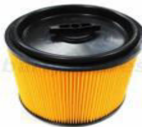
Fig -3: HEPAfilter

A particulate air filter is a device composed of fibrous or porous materials which remove solid particulates such as dust, pollen, mold, and bacteria from the air. Filters containing an adsorbent or catalyst such as carbon may also remove odors and gaseous pollutants such as volatile organic compounds or ozone from the air for better purification of air in many ways. Air filters are used in applications where the air quality of a particular region is important, and these filters provide air filtration processes notably in building ventilation systems and in engines. Some of the buildings, as well as aircraft and few other human-made environments (e.g., satellites and space shuttles), use foam, pleated paper, or spun fiberglass filters elements. Another method, air ionizers, use fibers or elements with a static electric charge, which attract dust particles, and the purification of air is done. Typical Oil bath filters have fallen out of the tradition. This type of technology of air intake filters of gas turbines has improved providing the new types of filters known as HEPA filters.