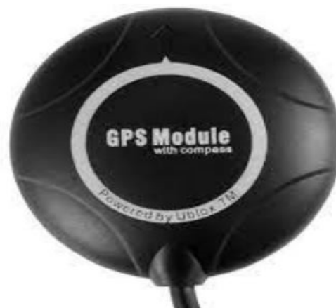
Fig -2: GPS Module

The NEO-6M module is a GPS (Global Positioning System) module and is used for the navigation systems. The module simply checks the exact location on earth and provides output data in the longitude and latitude of the position of the user. It is a stand-alone GPS receiver featuring high-performance. U-Blox6 positioning engine. This GPS module is flexible and cost-effective receivers offer numerous connectivity options in a miniature (16 x 12.2 x 2.4 mm) package. The compact design, architecture, power, and memory options make NEO-6 modules ideal for battery-operated devices with very sensible cost and space constraints. Its Innovative design gives NEO-6M an excellent navigation performance even in the most challenging environments. And it successfully delivers the location information.