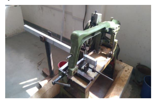
Fig -1: Cutting of Al6063

Matrix alloy was collected and cut in small pieces for primary melting using automatic hacksaw.then these were allowed to melt upto 750\,^{\circ} for one hour.