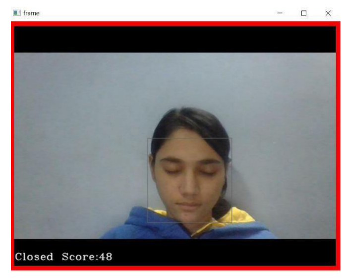
Fig 2.2. Image of a driver with closed eyes