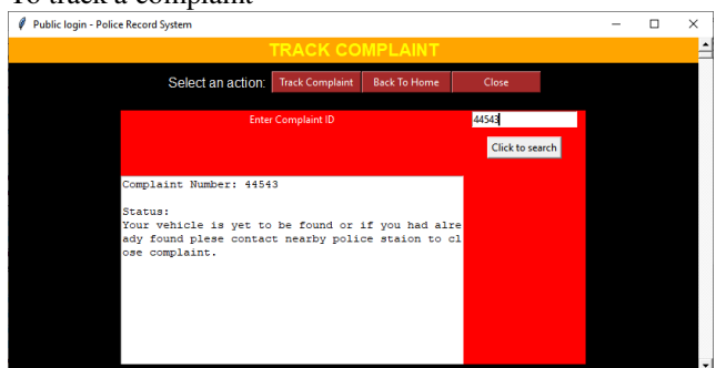
Fig 4. Track Complaint Status by user