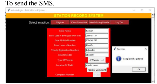
Fig 5. Registering complaint by Police station

To update the status regarding the filed complaint.