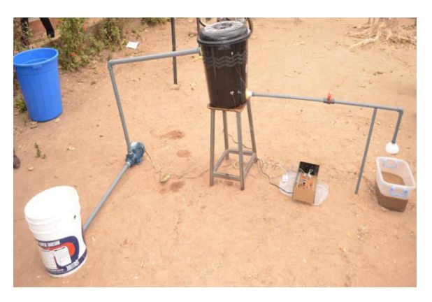
Fig:1 Simple wiring diagram of the system

The system consists of a soil moisture sensor, PIC microcontroller and relay interface card. The irrigation system consists of lanes that flood all areas and the flood is controlled by valves, as shown. There is also a motor pump that is used to fill the water tank..