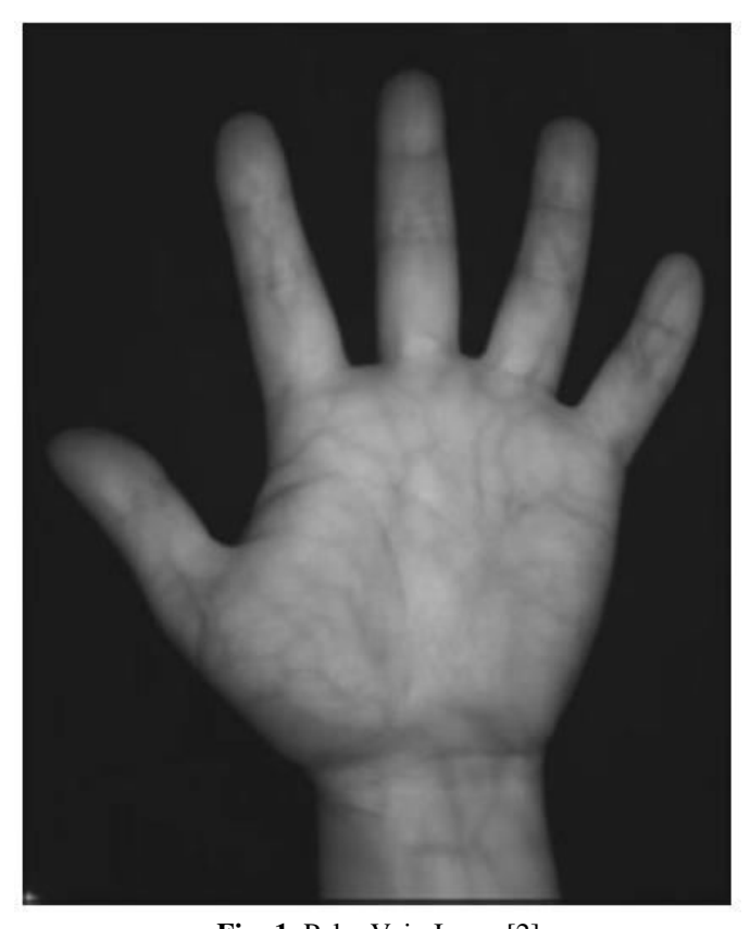
Fig -1: Palm Vein Image[2]