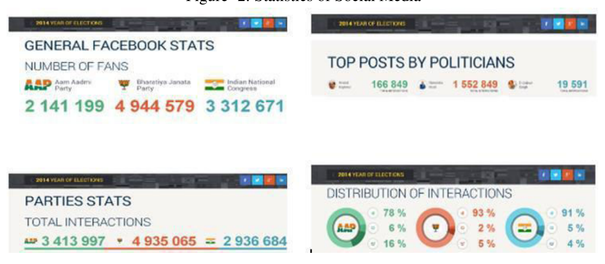
Figure -2: Statistics of Social Media

Twitter had its own "Tweeter Election" for general election 2014. A total of 56 million election-related Tweets were accounted till the end of the general election. Each poll day of general elections 2014 wit- nessed tweets ranging from 5.4 lakhs to 8.2 lakhs (Verma, 2015). The tweeter results indicate that the most popular parties and candidates were AamAadmiParty's (Delhi-based regional political party) ArvindKejriwal, Leader of Aam Admi Party and Chief Min- ister of New Delhi, BJP4India's (Official tweeter account of Bhar- tiya Janta Party) Narendra Modi and Rahul Gandhi (Vice President of Indian National Congress) from Indian National Congress India (National Political Party). Mr.Narendra Modi led with 3.97 million followers growing from his base by 21% as compared to his status on January 1st, 2014. Mr. Arvind Kejriwal raised to 1.97 million he made an amazing growth of 79% as compared from the beginning of the year. Indian National Congress India who entered late on tweeter had 178k followers but showed an incredible growth of 376% as compared to 37,357 followers what it accounted January 1st, 2014 (Wani & Alone, 2014).