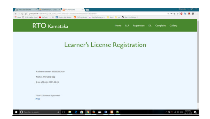
Fig 4. Status of LLR which is approved with a print option

Using this functionality, citizens can monitor the status of their LLR, DL and vehicle registration application whether it is approved or rejected. To check the status, citizen must enter the Aadhaar number and password entered while applying. In case of LLR, citizen can also download the approved learner's license.