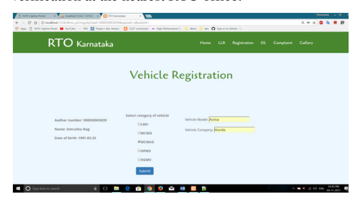
Fig 3. Applicant will be asked to submit COV, vehicle model and company

date for the documents verification at the nearest RTO office. This section is for the citizens to register their newly bought vehicles. The citizen will be asked to apply through their Aadhaar number and a password to be used for authentication. The citizen will be asked to submit the details of the vehicle such as the category of vehicle, vehicle company and the vehicle model. After the details are entered, the system will generate an appropriate date for the documents verification at the nearest RTO office.