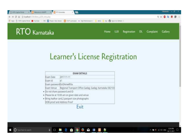
Fig 1. LLR test date, ID, password and venue is generated after selection of COV by the LLR application.

Citizen who craves for a Driving License (DL), by applying for a learner's license registration (LLR) through their Aadhar number a password which will be used for authentication of the citizen in the future. The system is expected to allow only those citizens who are 18 years old or above for registration. All the minor applicants will be denied of further processing. Once age is verified, the citizen is asked for the category of vehicle (COV) for which he/she wants to apply. After selecting COV, the system will generate an appropriate date, exam ID, exam password and venue for the LLR test. The venue for the test is decided based on the citizen's address and accordingly, the nearest RTO office is assigned as the test venue.