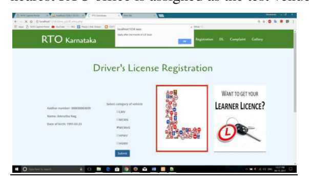
Fig 2. If LLR issued period is less than one month, asks the DL applicant to wait for one month

LLR, he/she can apply for driving license, again through their Aadhaar number and a password as in the case of LLR. The system will check whether the LLR issued period is more one month and less than six months or not. If the LLR issued period is less than one month, the citizen will be asked to wait till one month completes. If the LLR issued period is more than six months, the system will ask the citizen to re-apply for LLR. On a legitimate time of the LLR, the citizen will be asked for the COV to match whether LLR has been issued for the same COV for which the citizen is applying driving license for. On a correct match, the system will generate the test date, test ID and test venue. In this case also, the venue for the test is decided based on the citizen's address and accordingly, the nearest RTO office is assigned as the test venue.