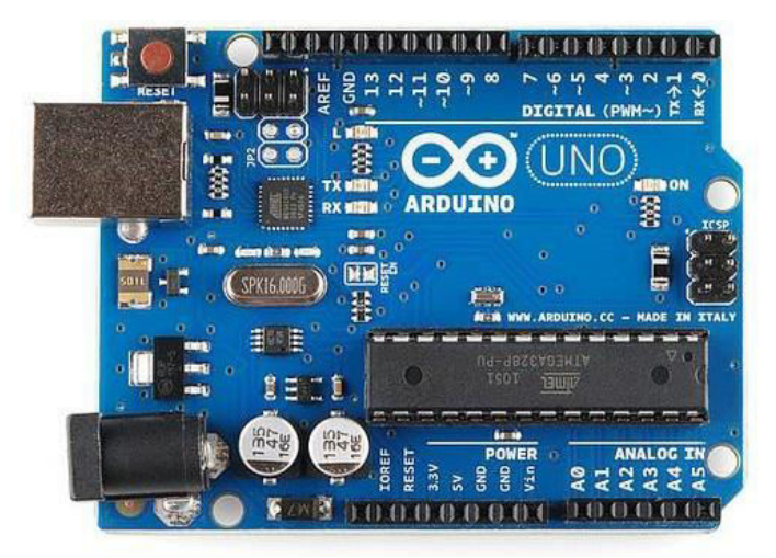
Fig 1- Arduino Board

software. It has 14 digital input and output pins and 6 analog inputs for communication with sensors, switches, motors and other electronic components. It has a 16 MHz ceramic resonator, a USB connection, an external power connection and an in-circuit serial programmer (ICSP) connection, a reset button, GND pin as ground and a 5V pin to provide 5 voltages. The voltage is 5 V, and the input voltage is 7 to 12 V.