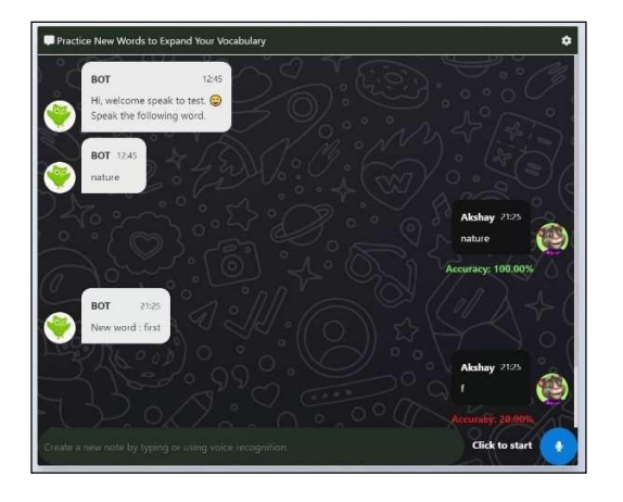
Fig.2 Practicing of word

User has to speak the word appeared on the screen. When user speaks the word then our system will convert spoken word to text and then appeared word will get checked to spoken word and ML module will check the accuracy and we will display the accuracy. If accuracy is very less then user has to speak that particular word again, this process will be happening repeatedly until user speaks the accurate word.