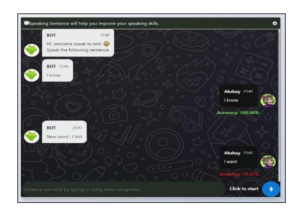
Fig.3 Practicing the sentences

The user is required to utter the sentence that appears on the screen. When a user speaks a sentence, our machine converts it to text, and is then tested against the spoken sentence by the ML module, which then displays the accuracy. If the precision is low, the user must repeat the sentence; this procedure will be