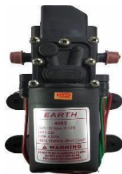
Fig.4. Electric diaphragm water pump

A diaphragm water pump uses the same principles to operate as the cylinders on your vehicle's engine are used. Inside the water pump there is a diaphragm made of rubber or plastic material. When the diaphragm is triggered, the pressure inside the pump lowers, which draws in fluid. The pump works using the water suction method which drains the water through an inlet and releases it through the outlet. These pumps are durable and easy to maintain. It is the actuator that waters the crop when required. When the soil becomes humid, then the pump comes into action. Using a pump reduces labor cost and time.