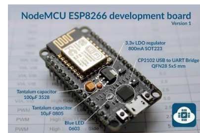
Fig.2. NodeMCU Development Board

NodeMCU is a low-cost open-source platform for all the users. It has the firmware which runs on the ESP8266 Wi-Fi SoC from Expressive Systems, and hardware based on the ESP-12 module. NodeMCU can be connected using Micro USB jack and External Supply Pin. It also supports UART, SPI, and I2C interface. The NodeMCU Development Board can be easily programmed as it is easy to use.