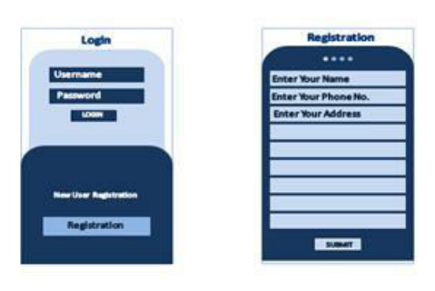
Fig. Application for farmers

software(apps) for two operating systems (OS): Android, andiOS. The Android application receives data from the publisher the Through the Cloud Server. The user receives data at particular I in intervals and the subscriber system performs suitable action.