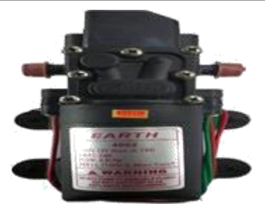
Fig. 12V DCWaterPump