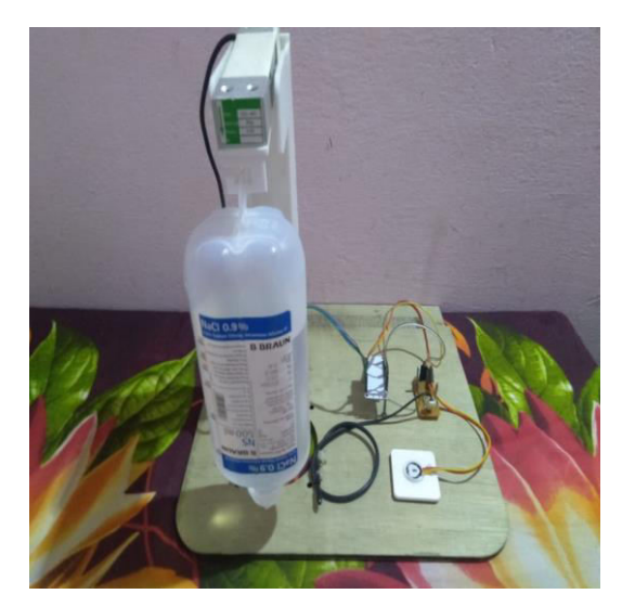
Fig: Hardware implementation