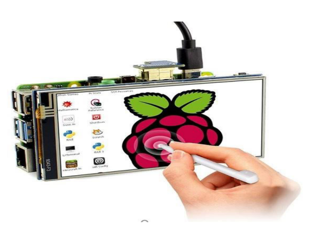
Fig.3. Touch Screen Module.