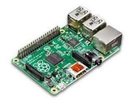
Fig.2. Raspberry Pi Board B.