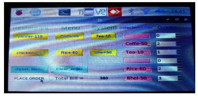
Fig. 4.1 User Section

Fig. 4.1 Shows User Section where customer placed their order. In this console customer can see food items with price and select quantity. Also, same time Bill will generate.