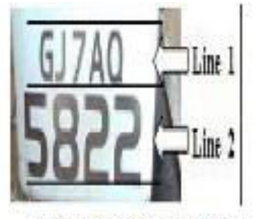
(b) Number plate with lines