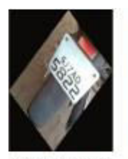
(a) Skewed image

The methods discussed in preceding sections are common methods for plate detection. Apart from these methods, various literature discussed methods As most of the for plate detection. methods discussed in these literatures use more than one approach, it is not possible to do category wise discussion. Different number plate segmentation algorithms are discussed below. In [5], Then statistical measurements in both windows were calculated based on the segmentation rule which says that if the ratio of the mean or median in the two windows exceeds a threshold, which is set by the, then the central pixel of the windows is considered to belong to an ROI. The two windows stop sliding after the whole image is scanned. The threshold value can be decided based on trial and error basis.