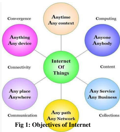
Fig 1: Objectives of Internet

Home Automation using cloud based system [9] focuses on design and functioning of home interface to collect data about data from home appliances and then send to the cloud data server to get saved on Hadoop Distributed File System. It is a process using MapReduce and use to implement a monitoring tasks to Remote user Presently Home Automation System is persistently developing its resilience by assimilating the current characteristics which gratify the rising interests.