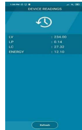
Fig. 4 Device Readings