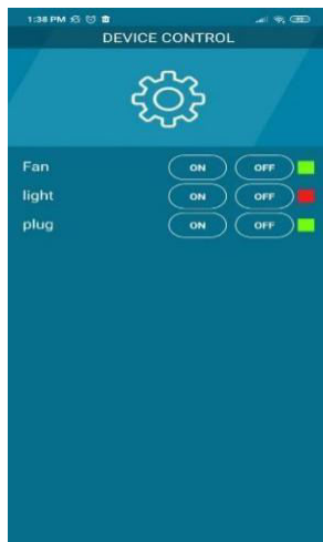
Fig 3. Device Control