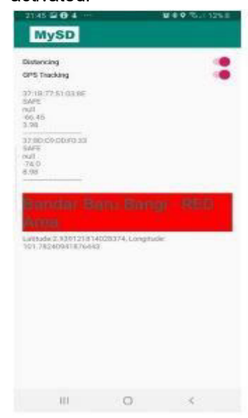
Fig. 6: MySD - Zone Level Notification and Social Distance Monitoring (SAFE)

categorised as SAFE. Hence, no alert will be activated.