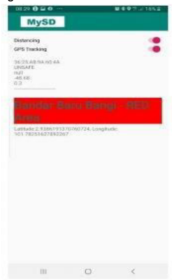
Fig. 7: MySD - Zone Level Notification and Social Distance Monitoring (UNSAFE)

in a situation that the user is too close and not adhering to social distance requirement, MySD will detect that the user is in category UNSAFE as shown in Fig. 8. When this is detected, MySD will trigger the phone to be continuously vibrating until the social distance requirement is met and the user is back to SAFE category again