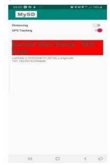
Fig. 3: MySD with GPS Tracking Enabled In addition, the notification will be triggered by MySD by displaying the message in the notification list on the phone as shown in Fig. 5 as well as making the phone to vibrate temporarily

In this section, the observation and the performance of MySD will be presented. By incorporating geo location and zone level status, the user will be notified and reminded about the zone where they are. By enabling GPS tracking as seen in Fig. 4, MySD will check the COVID-19 zone level of the current location.