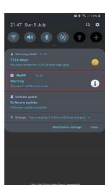
Fig. 4: MySD - Alert and Notification

We can also see that MySD will be able to determine different zone levels based on the location.