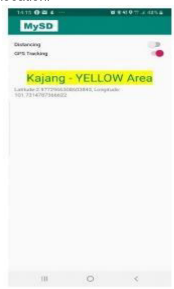
Fig. 5: MySD - Zone Level Notification

When the distance tracker is activated, MySD will start monitoring the distance between users who either carry smart phones or any other devices that can transmit BLE signals. In Fig. 7, we can see that if the distance is more than 0.5 meter or the average RSSI value is greater than -55dbm, MySD will consider the user is