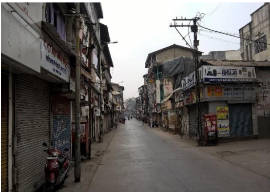
Fig -11: Shops and Wadas on the Main Road

Most of the young generation and the ones who have migrated and settled in the city apparently did not know much about the past. Nashik was among those few cities in India which has trams. The service between old Nashik and Nashikroad was started in 1891. Horses pulled the wagon. The starting point was the main road. However, the service stopped in 1925. 'Chitramandir' theatre was another landmark. If compared with today's main road, one would not believe that there was a small garden with wooden benches and decorative lamps along with the theatre. There was small outlet for snacks along with soda water and paan shop. The famous 'Sarkar wada', the heritage structure is located nearby.