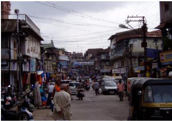
Fig -7:Savarkar path, Dahipool

In today's scenario it is one of the important commercial hubs. It offers everything right from the needle to clothing. It is one of the important chowks as it connects Saraf bazar and Bhadrakali area. Thus, Dahipool has its own distinguished identity.