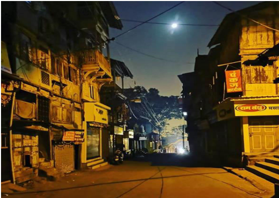
Fig-2:View of Nehru Chowk at Night

In the olden days, the old Mumbai – Agra highway (NH 3) connected this place with the Panchavati and rest of the Nashik. The road to Delhi used to pass through this place and hence Mughals built the famous Darwaza, the Delhi Darwaza. In today's context one would not find the actual Darwaza but the area between Godaghat and Nehru chowk is still known as Delhi Darwaza area. The area has kept its identity intact.