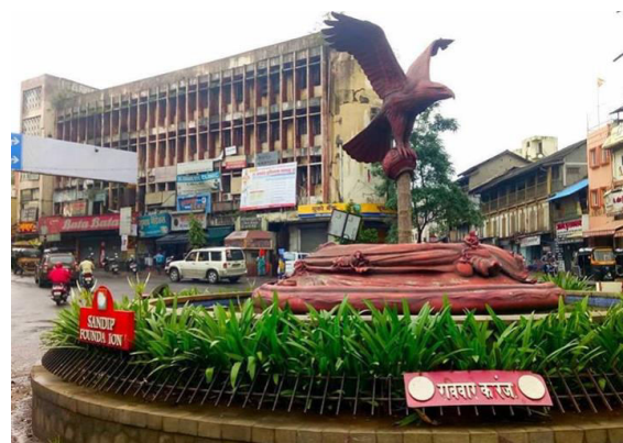
Fig -9:The famous Garuda Kumbha