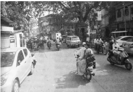
Fig-3:View of the famous PimpalPaar