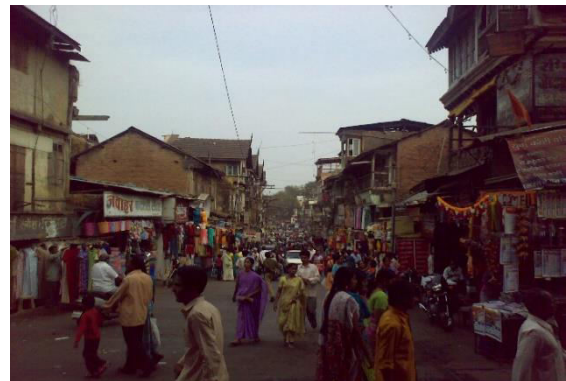
Fig -6: Busy street of Dahipool

Devotees and pilgrims had to pass by this chowk to enter the river. Pooja articles, flowers, milk and curd for the abhishekam, garlands, gajra – venya were all available here. this was the area that has a history over 350 years. Entire atmosphere was filled with fragrances of jasmine and roses. Overall, it had a devotional touch.