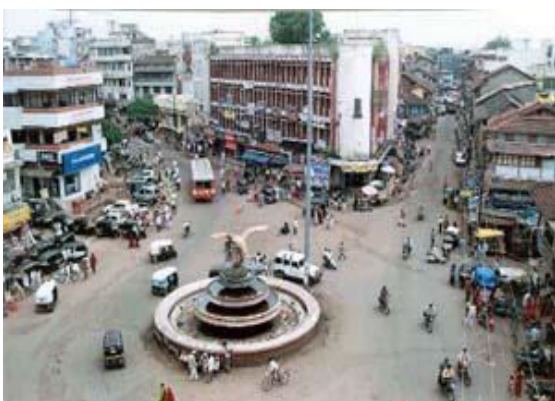
Fig -8:Ravivar Karanja

Ravivarpeth chowk or Ravivarkaranja is the most important chowk. In the history, Nashik was under Aurangzeb's rule. He destroyed all the religious places including temples and ghats. Thus, Nashik came to be known as an ordinary village. During the rule of Bajirao I Peshwa, Nashik went in the hands of Marathas. To revive the identity lost during the Mughal period, Peshwas started building new ghats and temples and thereby enhanced the beauty of Godavari. Old Nashik existed on the southern banks the Godavari river. Peshwas constructed new town by building new bridge to the west. During this time new settlements like Navapura, Kapadpeth, New Tambat lane, Nimani road came into existence. In the vicinity to the Ravivarpeth, Peshwas constructed a luxurious wada which later was known as 'Sarkar wada'.