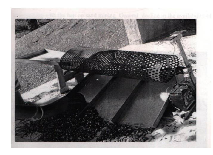
Fig.1Diagram of project models

In the long term, there can be a high return on investment due to amount of free energy a solar panel can produce, it is estimated that the average household will see 50% of their energy coming in from solar panels.