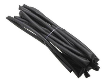
Fig. 6 -Wire Sleeves

Most electronics constructional projects involve at least some degree of soldering and wiring. Many projects have a printed circuit board, PCB, forming most of the project, but it is necessary to connect the PCB to other controls and sockets, etc.