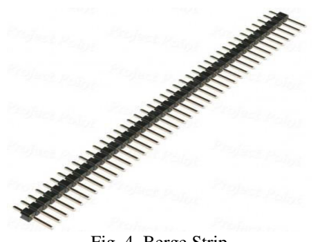
Fig. 4-Berge Strip

Berg Strip is a commonly found connector in all kind of circuit boards. It is also called as Berg Stick because of its stick like structure. Berg Strip is designed by the Berg Electronics Corporation at Missouri.