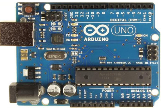
Fig. 1 - Arduino UNO

The digital and analog input/output pins equipped in this board can be interfaced to various expansion boards and other circuits. A serial communication interface is a feature in this board, including USB which will be used to load the programs from computer.