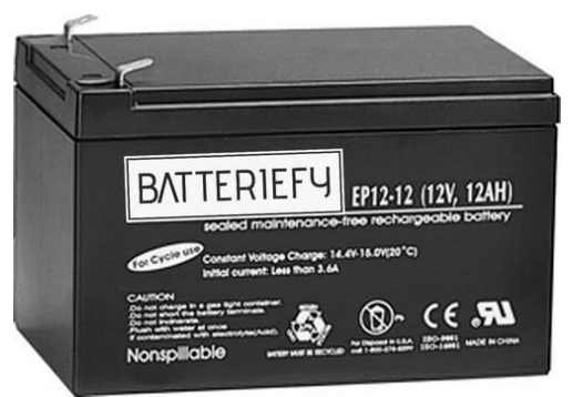
Fig. 3 –Battery

To store the energy and provide whenever needed is the function of battery. Usually this type of batteries is used for small applications. The battery life is good for use and they are rechargeable.