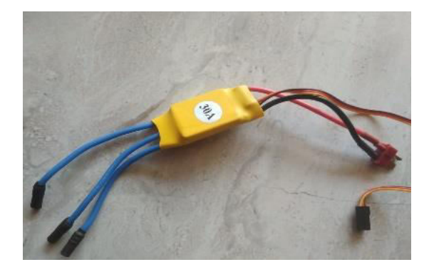
FIG: ESC (Electronic Speed Controller)

A brushless motor requires a different operating principle to control the speed. ESC is an electronic circuit that controls and regulates the speed of an electric motor. An electronic speed control follows a speed reference signal (derived from a throttle lever, joystick or other manual input) and varies the switching rate of a network of FETs. By adjusting the duty cycle or switching frequency of the transistors, the speed of the motor is changed. Brushless ESC systems basically create a tri-phase AC power output of limited voltage from an onboard DC power input, to run brushless motors by sending a sequence of AC signals generated from the ESC's circuitry, employing very low impedance for rotation.