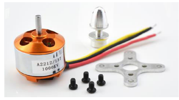
FIG: BLDC Motor

A brushless DC electric motor (BLDC Motor or BL Motor) also known as electronically commutated motor (ECM or EC Motor) and synchronous DC motors.Synchronous motors powered by Direct Current (DC) electricity via an inverter or switching power supply which produces electricity in the form of alternating current (AC) to drive each phase of the motor via a closed loop controller. The brushless motors are generally controlled by a three phase power semiconductor bridge. The controller provides pulses of current to the motor windings that control the speed and torque of the motor. This control system replaces the commutator(brushes) used in many conventional electric motors. A brushless dc motor is defined as a synchronous permanent machine with rotor position feedback.