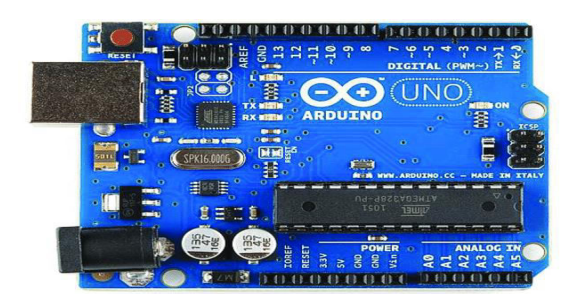
FIG: Arduino Uno Board

The Arduino Uno is an open-source microcontroller board based on the microchip ATmega328p microcontroller. Arduino board designs use a variety of microprocessors and controllers. The boards are equipped with sets of digital and analog input/output (I/O) pins that may be interfaced to various expansion boards (shields) and other circuits. The Arduino Uno is a microcontroller board which is based on the ATmega328. It has 14 digital input/output pins (in which 6 can be used as PWM outputs), 6 analog inputs, a 16MHz ceramic resonator, a USB connection, a power jack, an ICS header, and a reset button. It contains everything that needed to support the microcontroller; simply connect it to a computer through USB cable or power it to get started with an AC to DC adapter or battery. The Arduino Uno can be powered with an external power supply or via a USB connection.