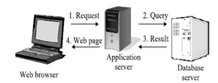
Fig. 1. SQL injection scheme

To gain a better understanding of SQL injection, we need to better understand the types of communication that occur during a typical session between a user and a web application. The following figure shows the average interaction of all objects in a standard webapplication.