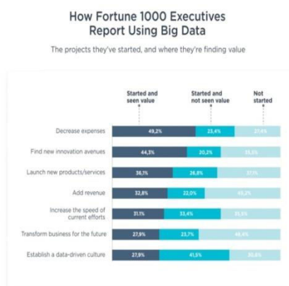
Figure 3 Report of numerous companies' data analysed for media marketing

All this will offer assistance marketers alter costs in a more adaptable and exact way to comply with client expectations. In none, 49.2% of business has seen huge information diminish their costs and 44.3% of them have found the unused advancement strategies. Numerous companies haven't utilized it however. See the point by point insights on the design underneath.