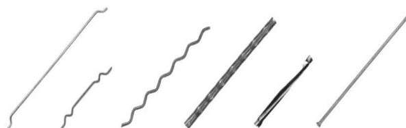
Figure 1: Different types of steel fibres used in HSFRC

However, the elasticity of a material is a function of its proportional cross-sectional area. As the diameter of the rod is reduced by one-half, its elasticity is increased by four factors. Tensile strength ranges from 345 to 1380 MPa.